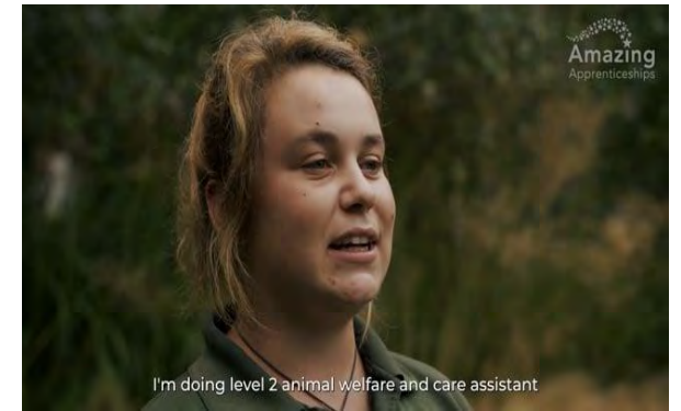
Sorcha @ Africa Alive! Apprentice Story Film